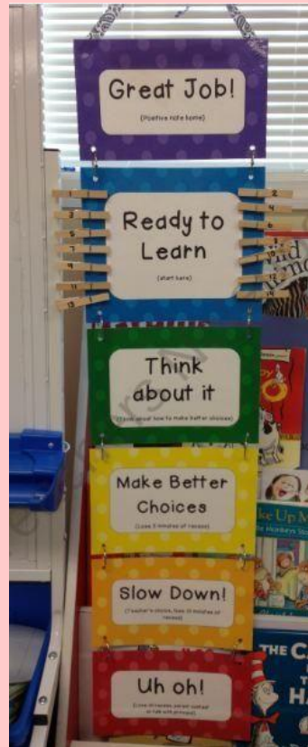
The Rainbow Ladder