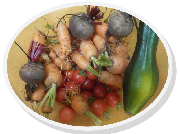
Growing things in our school garden

The best bit about this school is the really nice play times and hard sums.