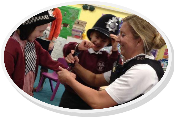
The school trips

Sparkle day in YR when I was a policeman and learning about dinosaurs in Y1. Doing the daily mile in Y2.